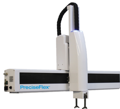
PreciseFlex™ 100 XZ Theta with gripper